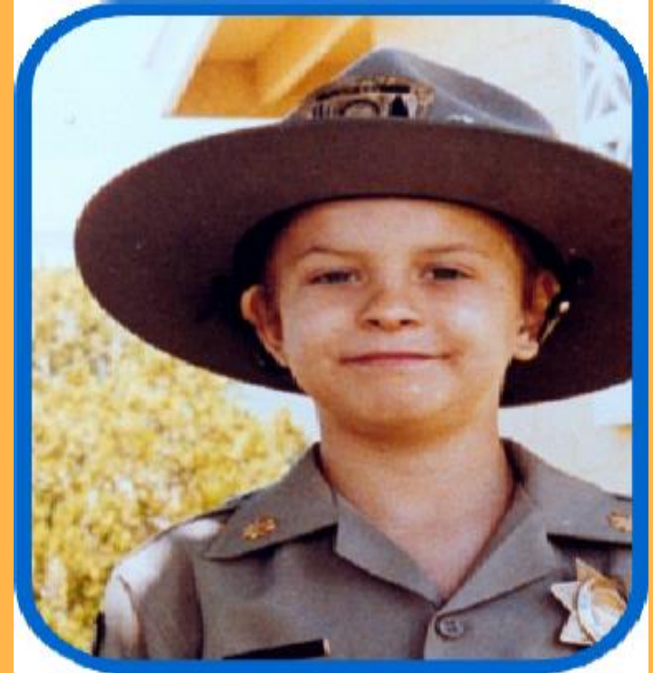
Little Bubble Gum Trooper