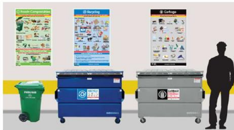
Figure 17: Container signage made available to property managers